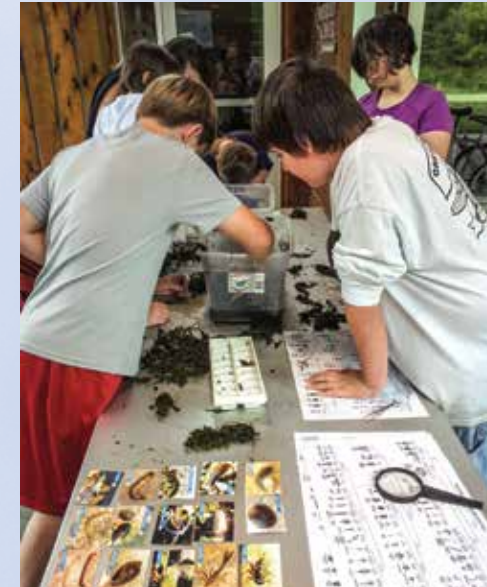
Hands-on learning teaches students about drinking water resources

Every person drinks water, lives in a watershed, and can help improve the quality and quantity of our most precious resource. We strive to connect people of all ages with information that can help. We share tips, information, and ideas through our website, social media, monthly meetings, classrooms, civic group meetings, and the C.W. Titus Education Facility at the Watershed Center. The Watershed Center at Valley Water Mill Park showcases stewardship practices and provides a place to experience and learn about water.