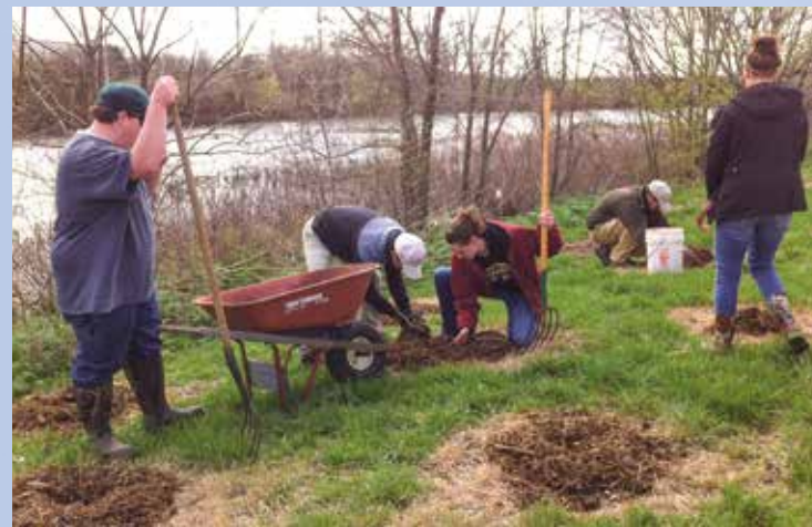
Volunteers work on a tree planting project along South Creek

A Great Investment Between 2006 and 2012, WCO brought in about $3M in grant funding for clean water!