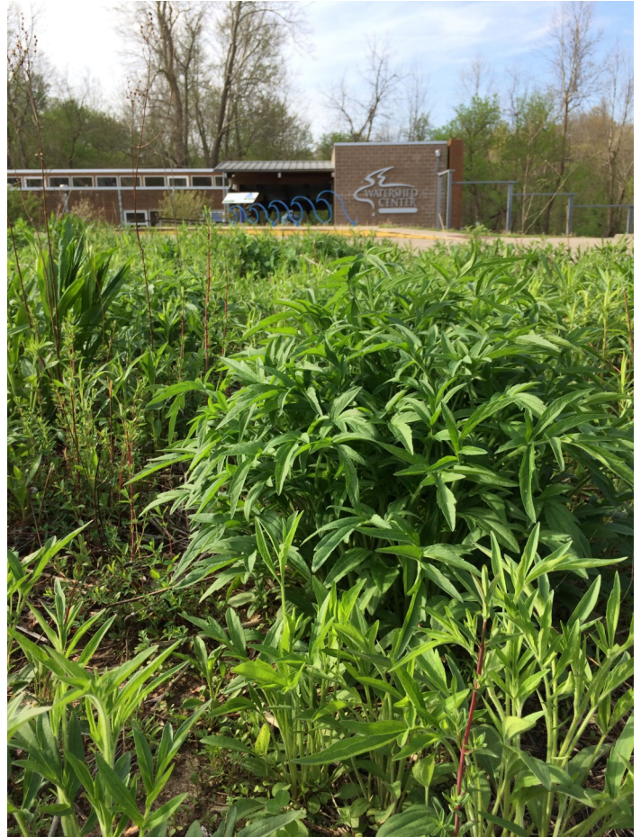
The prairie plot at the Watershed Center is responding with lushness to the first prescribed burn in January.

The Missouri Bird Conservation Initiative (MOBCI) grant is nearing completion at Valley Water Mill Park. Since receiving it nearly one year ago, Watershed Committee of the Ozarks has directed over 2,400 hours of volunteer service to restore native habitats at the Park and toward the fulfillment of the Missouri Bird Conservation Initiative aim to “get people excited about birds through pursuing and enacting integrated, all bird conservation.” And while the work we have achieved through MOBCI has been measurable, we see the need for continued work including removing various and pervasive invasives, and continuing to restore the many habitats present at the Park. We very much hope to partner with MOBCI again in the future.