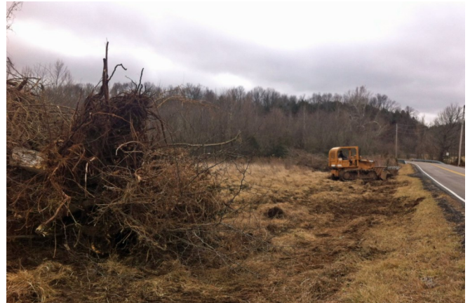
Fence removal at the Little Sac Agricultural Demonstration Area.