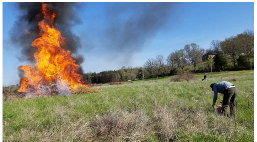
Burning "thorn trees" (honey locust) and cedar trees which had invaded the pastures at the Agricultural Demonstration Area.