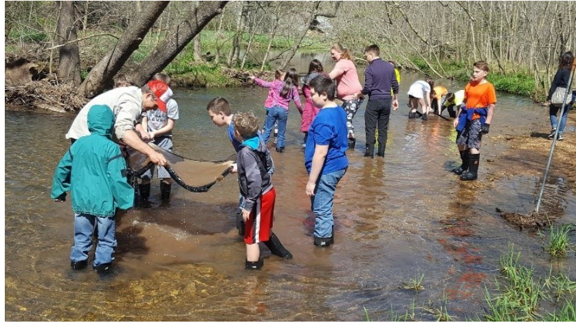
Sparta students exploring stream ecology.

Spring is always a busy season for field trips to the Watershed Center. This year is certainly no exception. In fact, many school districts have made first time visits to the park. Within the last few weeks students from Everton, Greenfield, Fair Grove, and Joplin have joined our regular field trip participants. We are excited about expanding the reach of our educational programs. Our goal is to include all schools in the watersheds that supply our drinking water as well as become a regional source of educational opportunities.