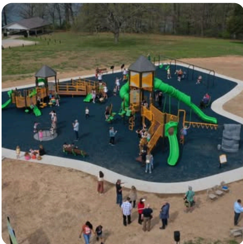
Hatch Playground at Miller Park

We are excited for visitors to enjoy this one-of-a-kind amenity, and grateful to the Hatch Foundation, Kiwanis Club of Springfield, City Utilities and many partners who made it happen!