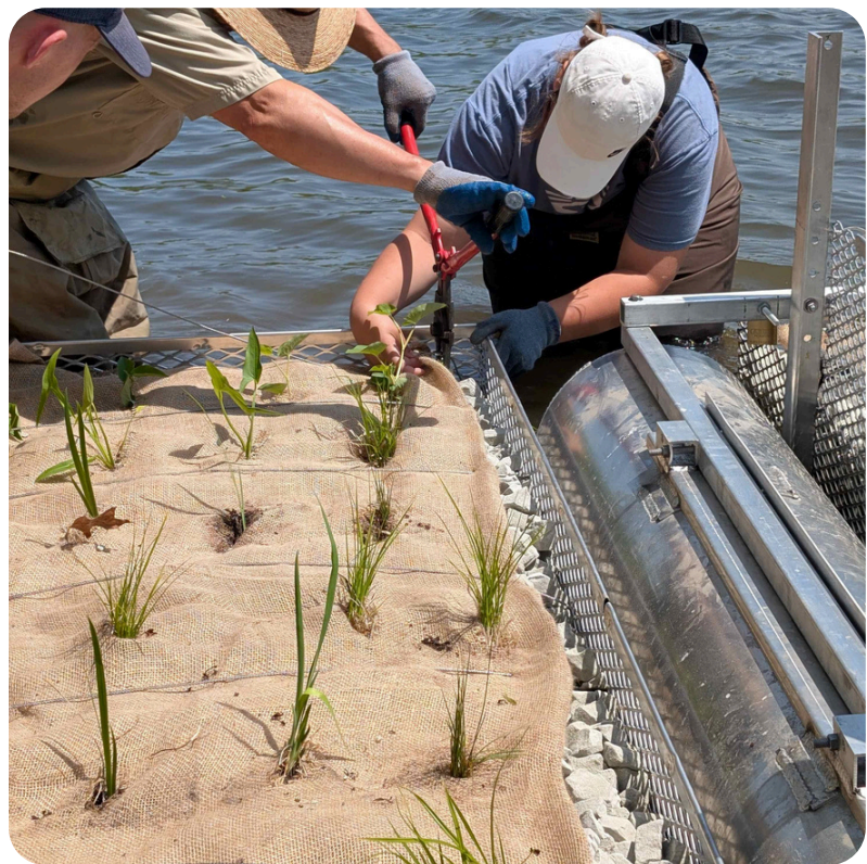
Final step, installing native plants