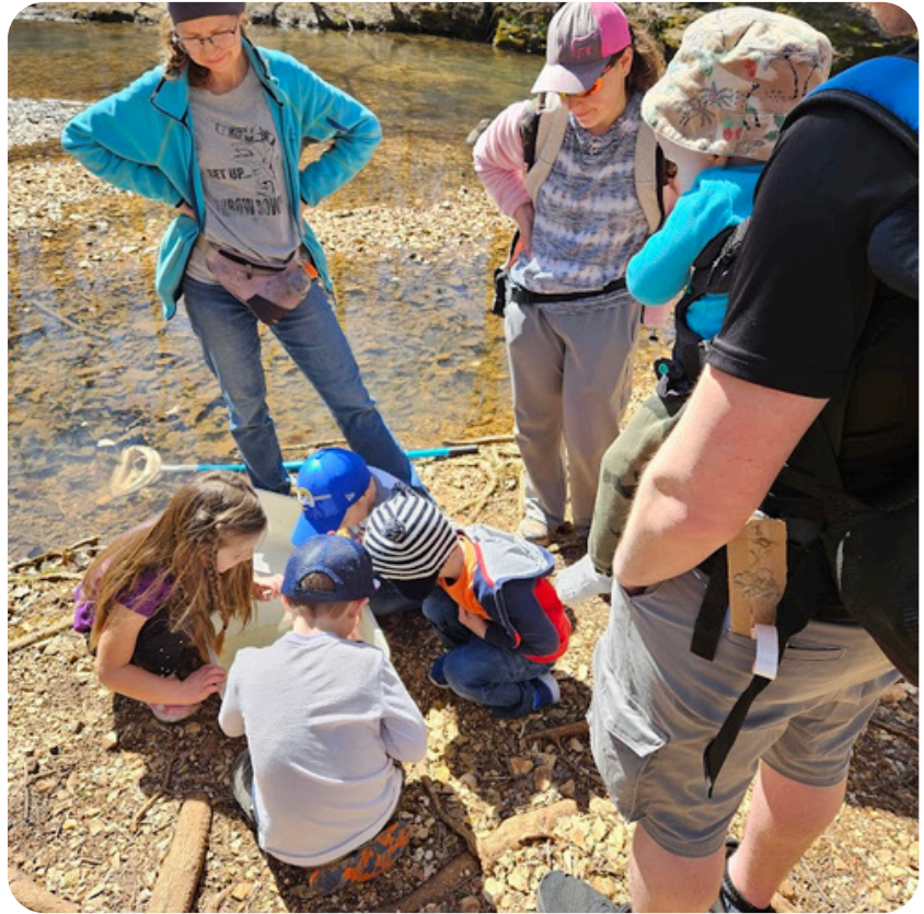
Investigating stream life and catching their first crayfish!