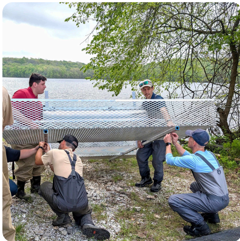
Mid-way through construction, assembling baskets