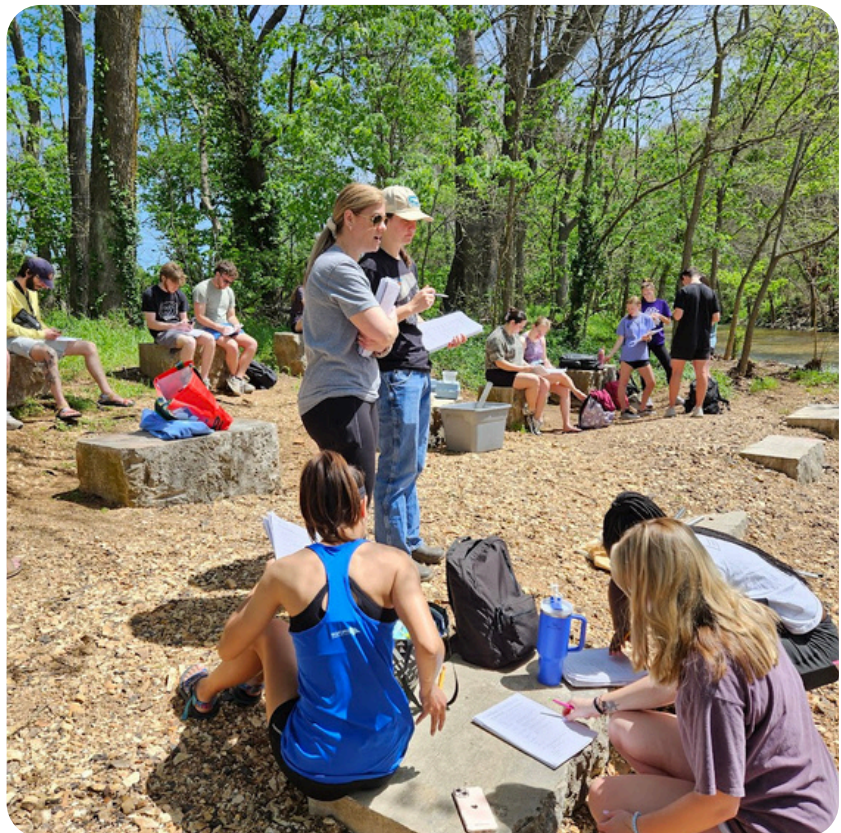
MSU students studying stream ecology