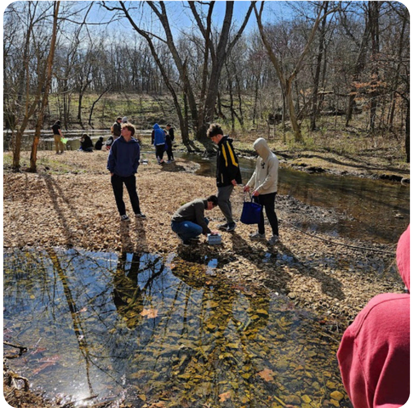
Students exploring aquatic life at the confluence

Despite the frequent rains and thunderstorms, it has been a busy spring for field trips to the Watershed Center. School groups ranging from kindergarten to college students have participated in field experiences this spring. Activities ranged from guided nature hikes exploring the connection between healthy land and healthy water, Project WET activities like a stream crossing challenge, to the classic wading in an Ozarks stream and catching critters to learn about stream ecology.