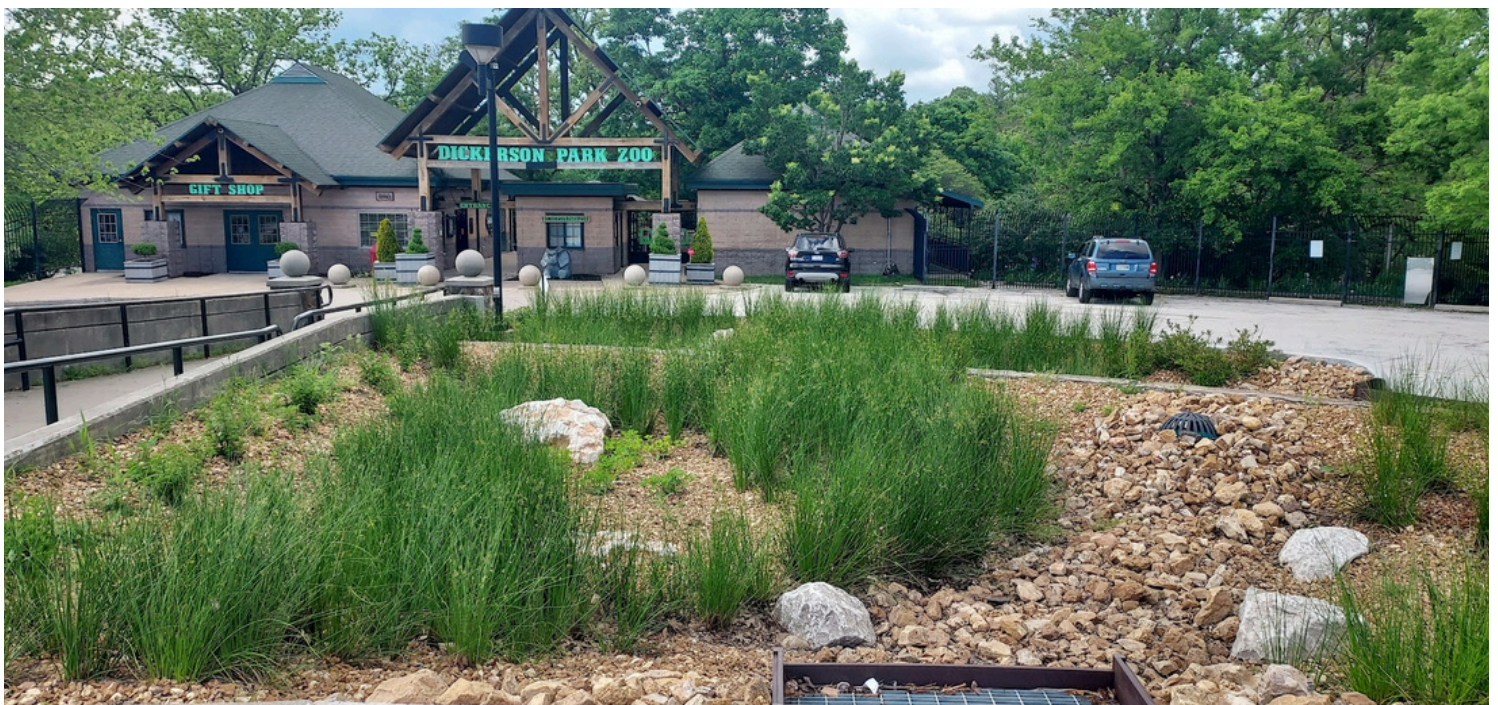
Rain garden at Dickerson Park Zoo

These water quality improvements would not be possible without the grant steering committee and project partners to assist with implementation and performance monitoring of the selected practices.