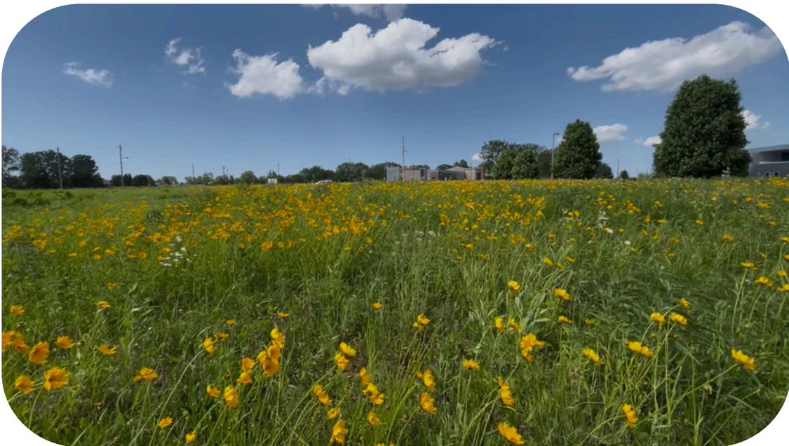
Coreopsis blooming in a DNG (Diverse Native Grassland) restoration

We have also made great progress with ongoing habitat enhancement at Valley Water Mill Park, mostly by completing two more sections of Timber Stand Improvement (TSI), including facilitating a timber harvest on-site, and beginning another section of TSI by using a forestry mulcher to get a jump start on the invasive species dominance and reducing the stand density of smaller diameter trees/shrubs. We plan to continue working on the new TSI section this year and continue invasive plant management across the entire park.