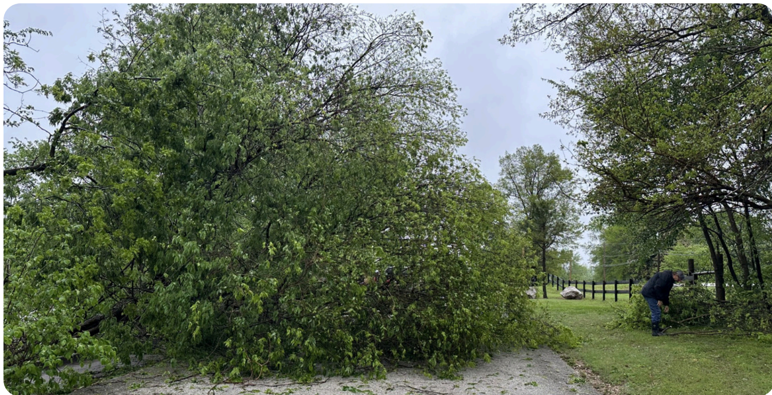
Pictured: Fallen tree at the Watershed Center