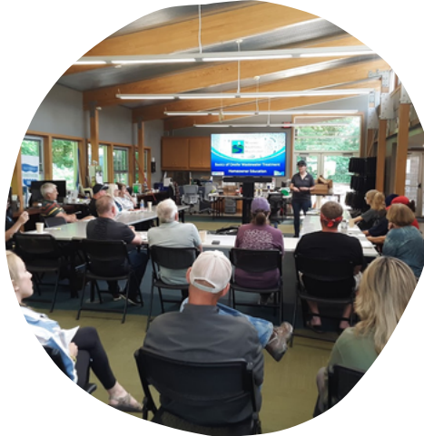
Workshop at the Watershed Center

On June 4, Watershed and Missouri Smallflows hosted an educational onsite wastewater presentation and educational walking tour of the Onsite Wastewater Training Center.