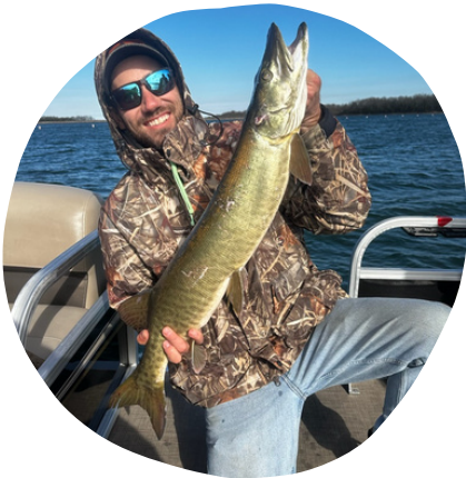
Muskie at Fellows

Our anglers have enjoyed a fantastic summer, reeling in plenty of bluegill, bass, and catfish. The unusually high water levels in July have extended the spring bite well into the summer season. If you're interested in learning the art of fly fishing, Fellows Lake offers an Intro to Fly Fishing class. Learn the basics of fly casting and catching with our staff anglers. Call the shop or visit our website for details.