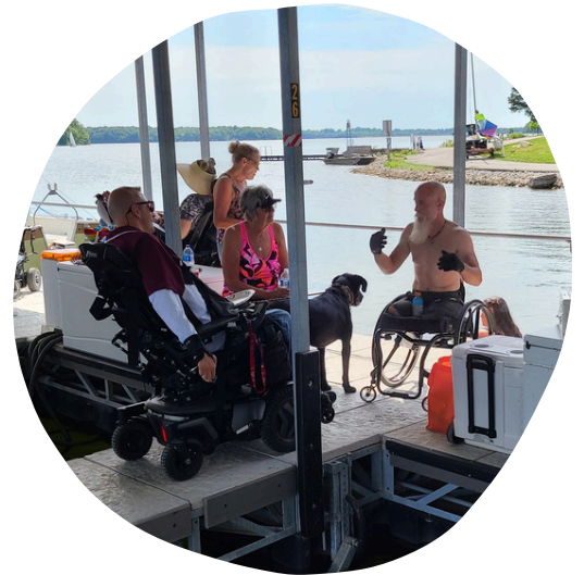
MSU OT Accessibility Event >>>