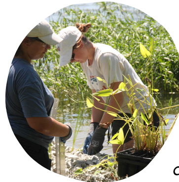
◀◀ Interns plant wetlands at Fellows

This summer has been lively! Led by the Missouri Department of Conservation , the Floating Wetlands Project is a collaborative effort including City Utilities, City of Springfield, Missouri Department of Natural Resources, Missouri State University, Ozarks Technical College, and the James River Basin Partnership.