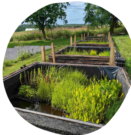
Aquatic beds at Watershed Natives Nursery

LEARN MORE ABOUT OUR CO-OPERATIVE AGREEMENT AT WATERSHEDCOMMITTEE.ORG