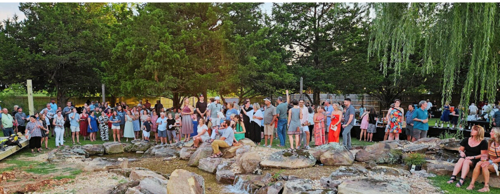
Pictured: Watershed Summer Gala