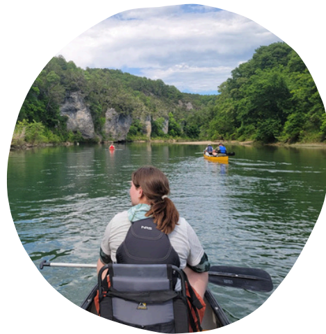
Surveying Tree of Heaven on the Buffalo

The Watershed Conservation Corps (WCC) is deep into invasive plant season, tackling a variety of projects across the Midwest. Due to the seasonality of invasive plant management, this time of year is particularly busy for our crews.